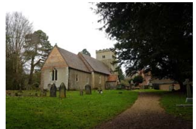
All Saints Church