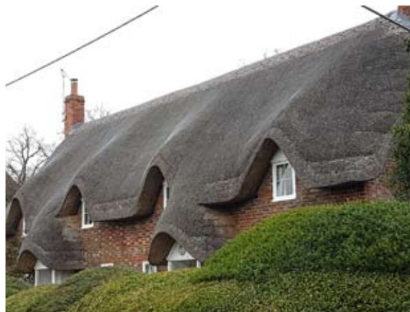
Thatched cottages on Church Lane

Leaflet © Pewsey Vale Tourism Partnership