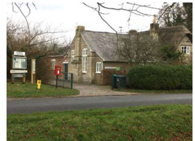
The Village Hall